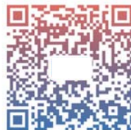
Smart Coffee Scale

1. Scan the below QR code to download “Smart Coffee Scale” application for iOS